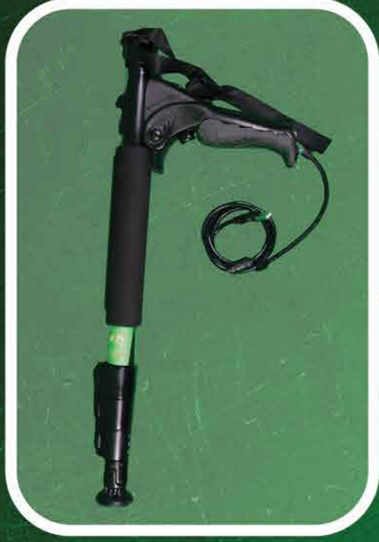
Great 2S device